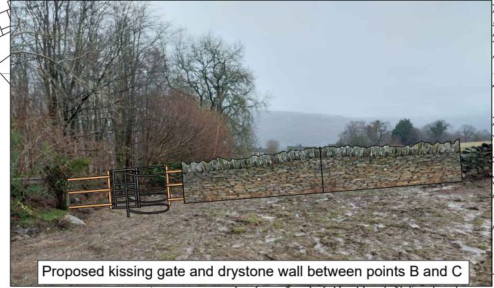
Proposed kissing gate and drystone wall between points B and C