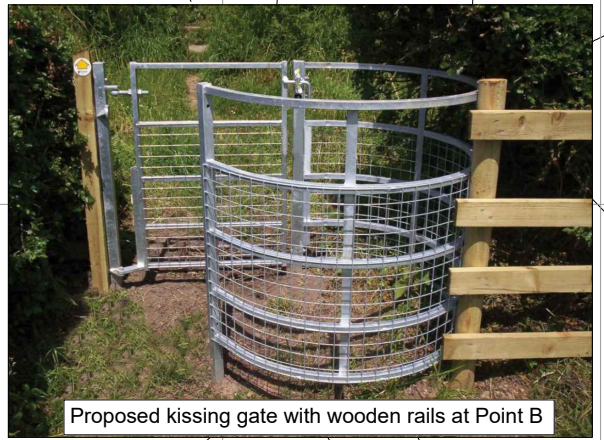
Proposed kissing gate with wooden rails at Point B

Kissing gate to be installed and tied in to nearby drystone wall boundary with wooden rails