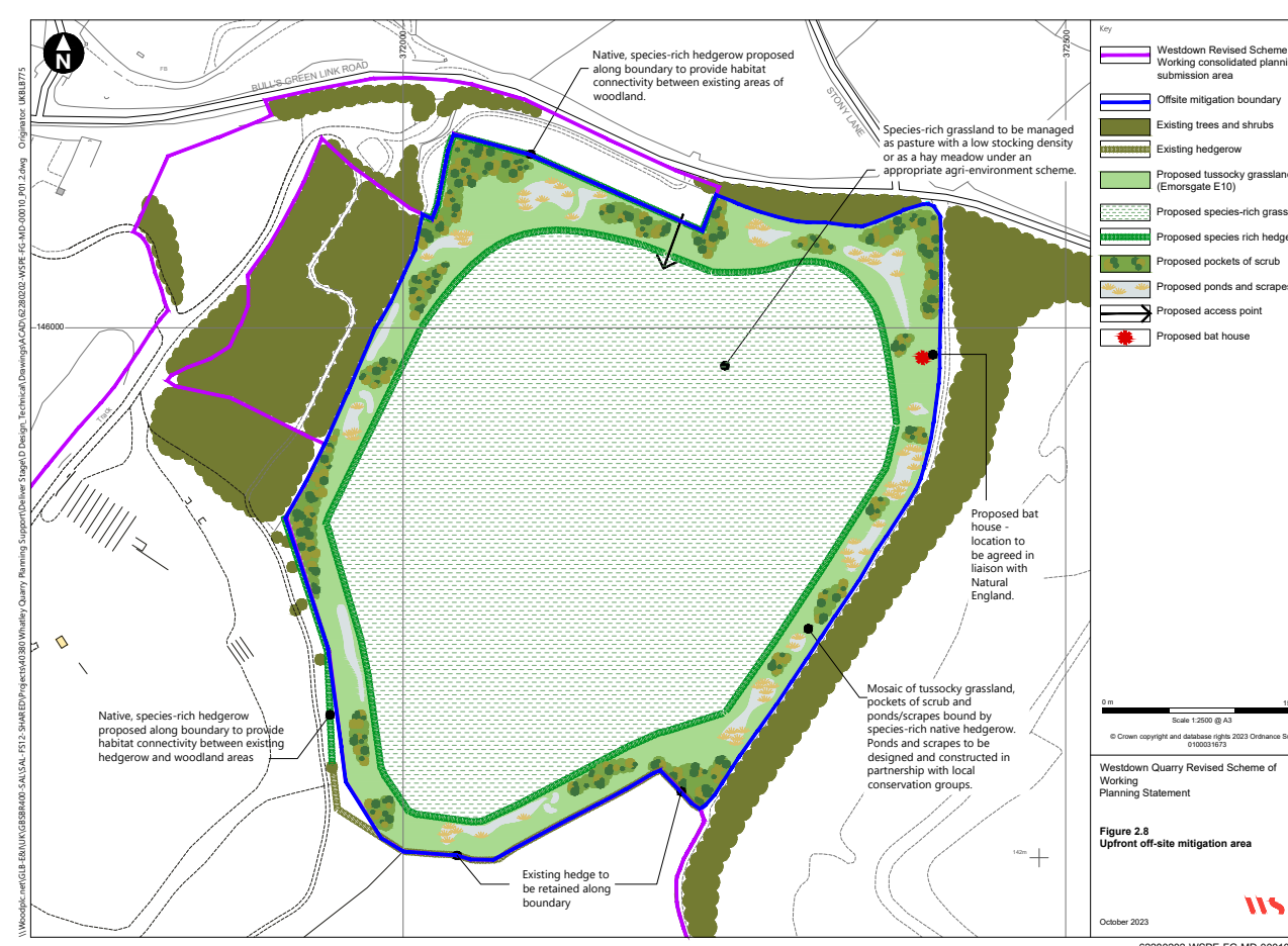
Upfront offsite mitigation area